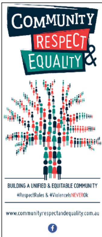
1. Pull up banner

Please fill in the quantities above and send this form to geraldton@kicksolutions.com.au , to receive a more accurate quotation. These prices were updated in August 2022.