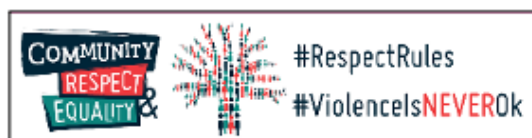
7. Vinyl Stickers