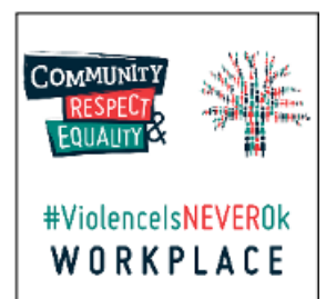
6. Workplace Stickers