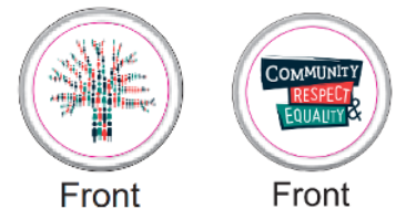
3. Lapel Pins