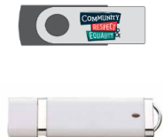
2. Flash USB